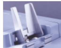
Option (Extension hopper)

The UW-100 is designed for table top operation that minimizes the operators movement thereby reducing stress and tension. The reject pocket and feed mechanism are in close proximity to each other to minimize balancing time.